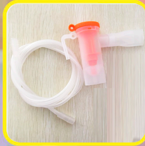
Pediatric Cup & Mouthpiece