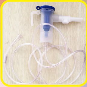
Adult Cup & Mouthpiece